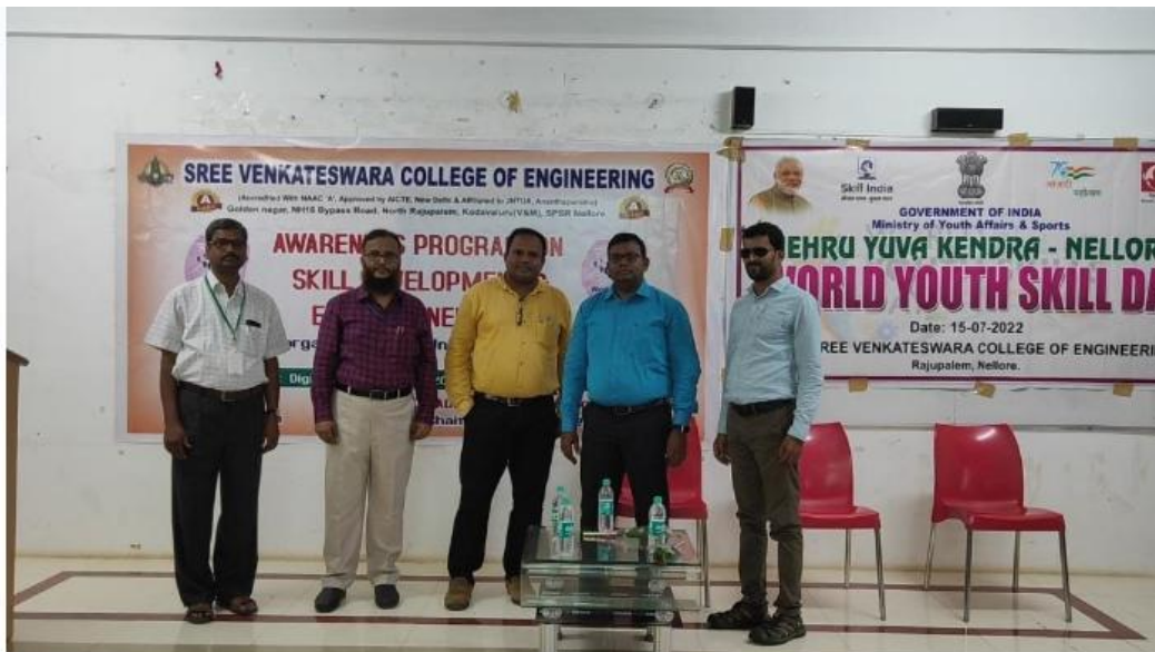
Group photo with Dignitaries on World Youth Skills Day